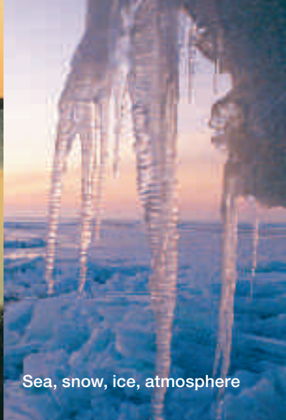
Sea, snow, ice, atmosphere