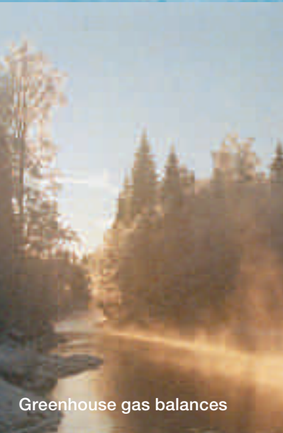
Greenhouse gas balances