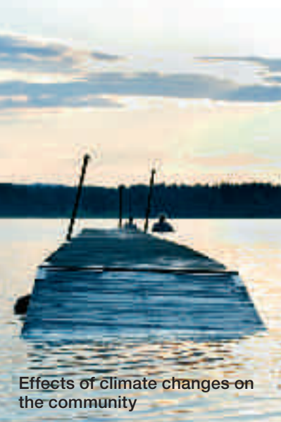
Effects of climate changes on the community