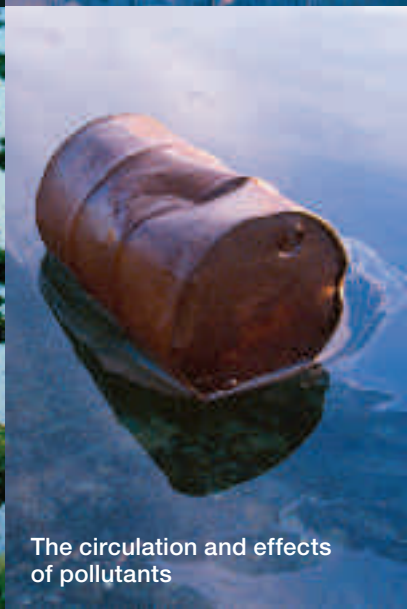
The circulation and effects of pollutants